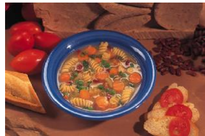
vegetable soup with pasta