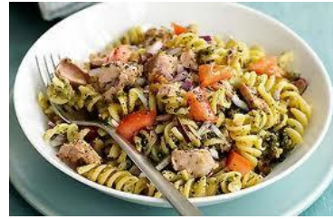
tuna pasta salad