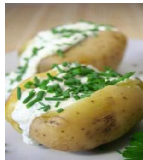
jacket potato with cream cheese