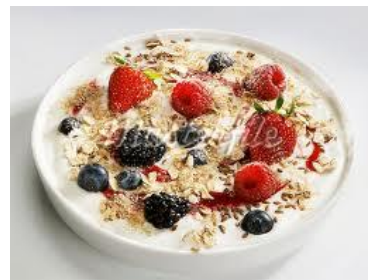
muesli with fruit